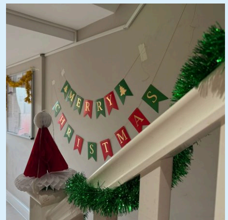
Christmas Jumper Day · across the service, hot food, festive cheer