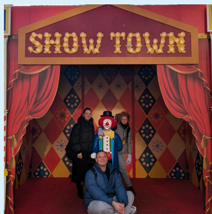
Outings · Christmas markets, lunches, conventions, theatres