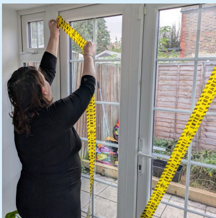
Halloween · pumpkin carving and parties across Aspen House

For people who have spent years inside services that didn't celebrate them, marking these moments matters. We celebrate every birthday across our homes, with cake, decorations, and the people who matter to them. Even Buddy, our therapy dog, gets his own cake.